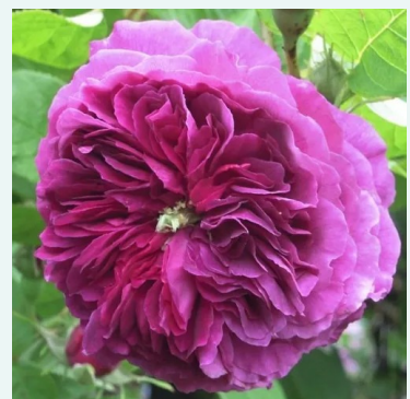
Erinnerung an Brod

crimson - historic, hybrid perpetual rose 3.6-5.2ft (110-160 cm) very strong, garden-filling scented rose - deeply spicy sweet Bertrand Guinoisseau -Flon