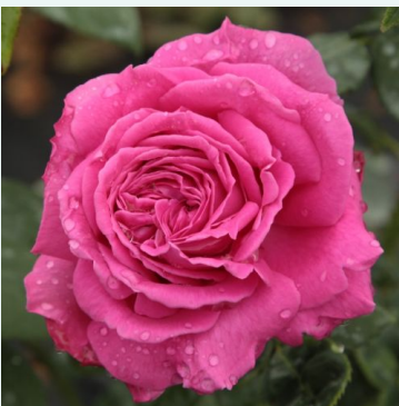
Madame Isaac Pereire