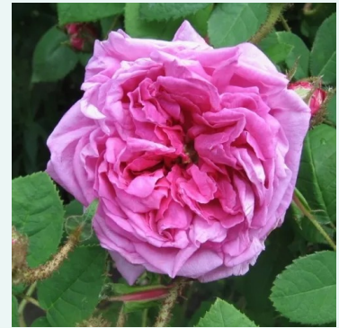
Julie de Mersan

pink - historic - perpetual hybrid rose 3.3-4.9ft (100-150 cm) strong-very strong, long-lasting scented rose - scent description not available Jean Desprez