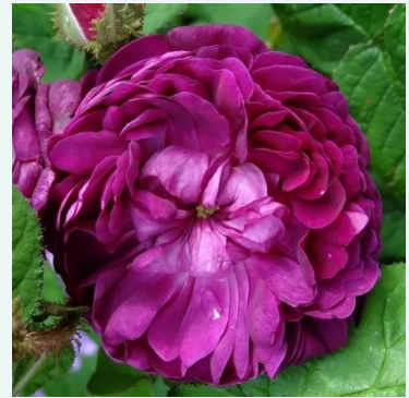
Capitaine John Ingram

pink - historical, centifolia rose 3.9-5.9ft (120-180 cm) very strong fragrance, noticeable from a distance rose - classic, rose-like character Duhamel