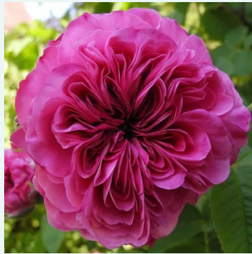
Duc de Cambridge