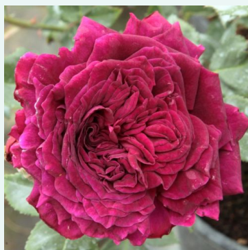
Empereur du Maroc

pink - historic, portland rose 3-4.6ft (90-140 cm) strong, long-lasting scented rose - full, classic old-rose scent René Lévêque