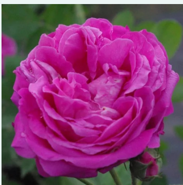
Duchesse de Rohan

pink - historical, china rose 3.9-5.9ft (120-180 cm) strong, well-scented rose - slightly sweet, classic rose character Jean Laffay